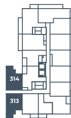
LEVEL 3,4,5 BUILDING A