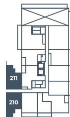
LEVEL 2 BUILDING A