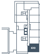
LEVEL 6 BUILDING A