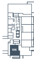
LEVEL 1 BUILDING A